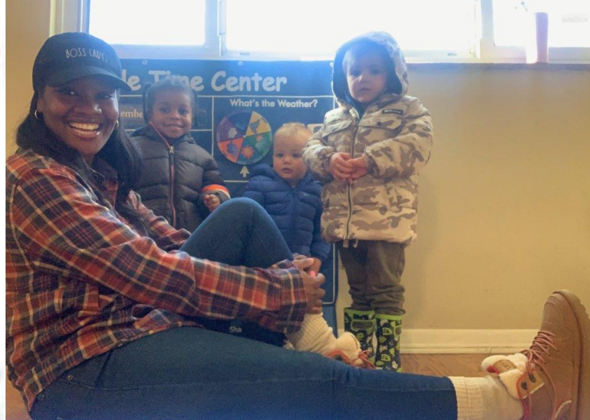
LIL DEE'S DAYCARE SOUTH COUNTY MO

750 Coats/Hoodies 300 Hats/300 Gloves/1000 socks