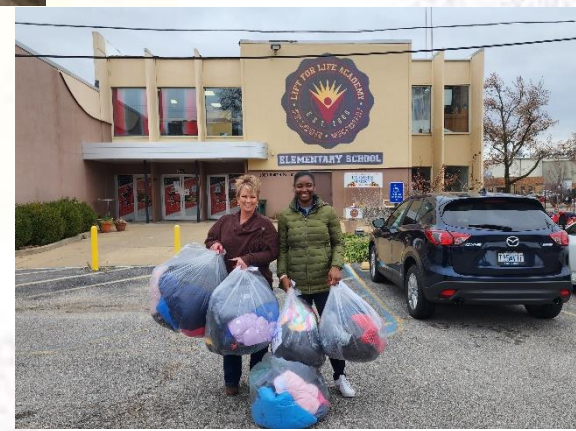
LIFT FOR LIFE ELEMENTARY SCHOOL ST. LOUIS CITY