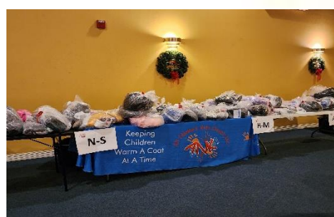
POWER KIDS CAHOKIA HEIGHTS IL