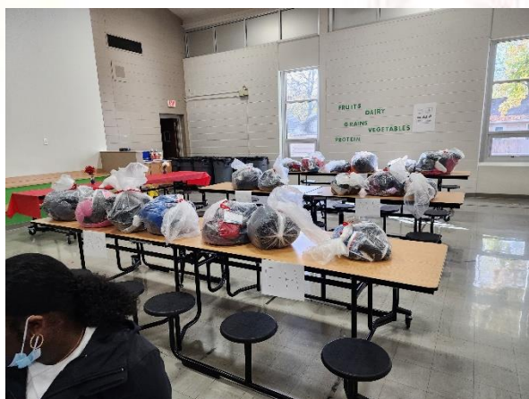
ABRAHAM LINCOLN SCHOOL