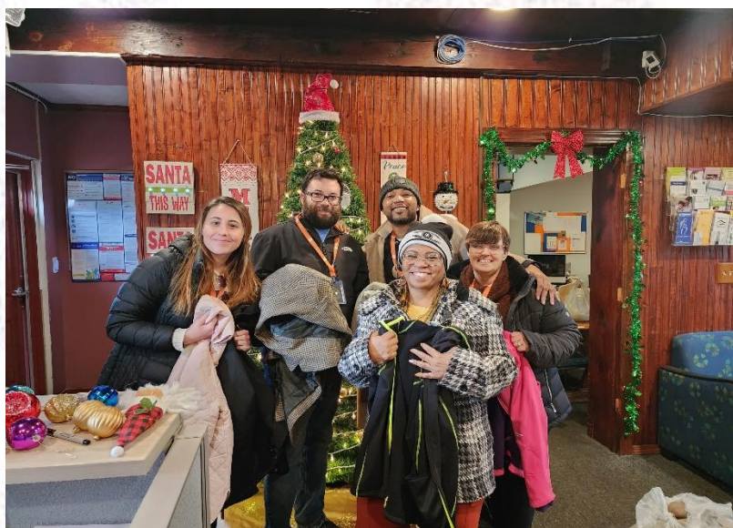
LOAVES & FISHES SHELTER ST. LOUIS, MO