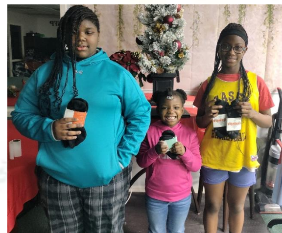
DEBORAH'S QUARTERS CENTRALIA IL

WESLEY HOUSE ASSOCIATION – NORTH ST. LOUIS MO SOCKS/COATS