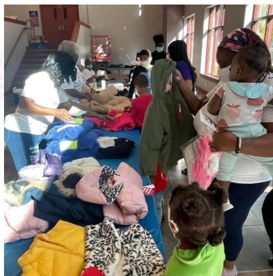
NORTH COUNTY SPANISH LAKE AREA